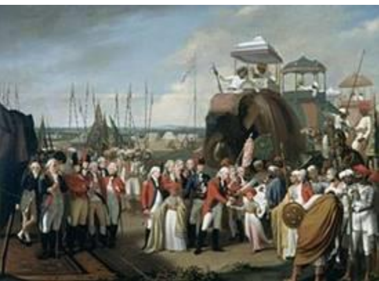
Lord Cornwallis in India